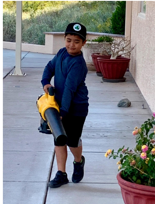
He looks like he's got the hang of it.